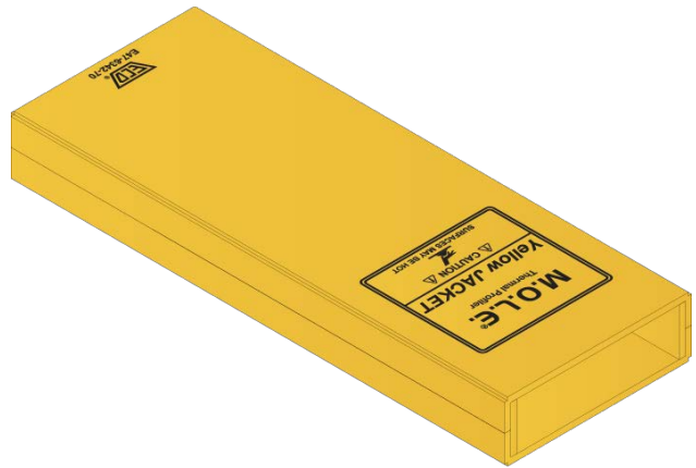
Yellow Jacket (Part Number: E47-6342-70)