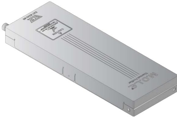
M.O.L.E.® Thermal Barrier (Part Number: E47-6342-80)