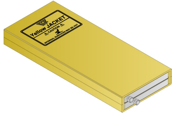
M.O.L.E.® Thermal Barrier w/Yellow Jacket (Part Number: E44-0944-80)