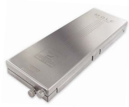
Figure 1 – External View