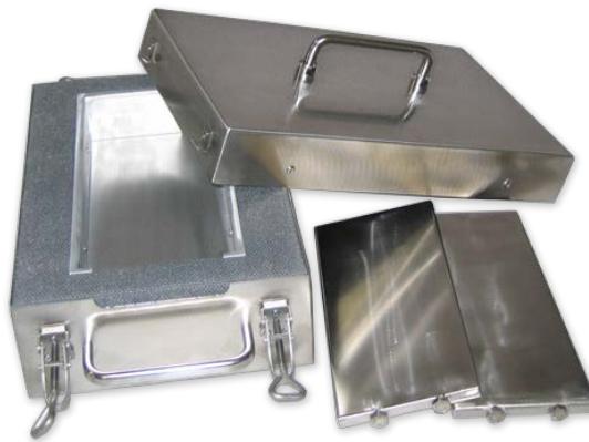
Figure 1 - Internal View